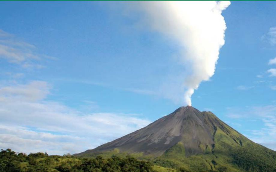
Arenal Volcano Arenal, Costa Rica