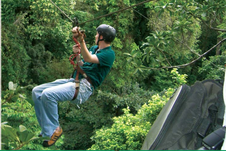
Canopy tour Monteverde, Costa Rica

Situated near the Continental Divide, the Monteverde (Green Mountain) Reserve contains a spectacular range of flora and fauna in six distinct ecological zones. On your excursion you'll tour the greenery of the Santa Elena Cloud Forest, a special part of the reserve. Look for rare orchids and elusive quetzal birds that thrive in Monteverde's perpetual soft mists—at this altitude, you'll literally walk through clouds. Leave your mark on the earth when you plant a tree in the EF reserve. Then, stop at a local school, where you'll have the chance to interact with Costa Rican students. During your visit, sample and share homemade specialties with the new friends you've made.