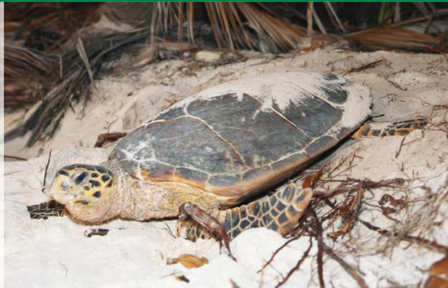
Green sea turtle Tortuguero, Costa Rica

Accessible only by airplane or boat, the Tortuguero National Park features 11 different habitats, including rainforests, swamps, beaches and lagoons. This incredible biological diversity makes it a fertile treasure trove for 375 species of birds, more than 2,200 species of plants and 400 species of trees. The park's Caribbean beaches are a key nesting ground for endangered sea turtles, while its rivers are home to manatees and crocodiles. Howler monkeys, jaguars and three-toed sloths call the forests home.