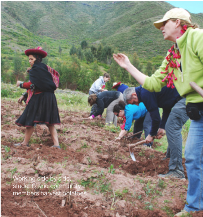
Working side by side, students and community members harvest potatoes