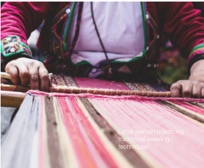
Local woman practicing traditional weaving techniques