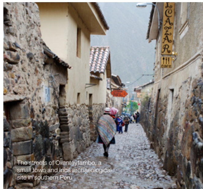
The streets of Ollantaytambo, a small town and Inca archaeological site in southern Peru