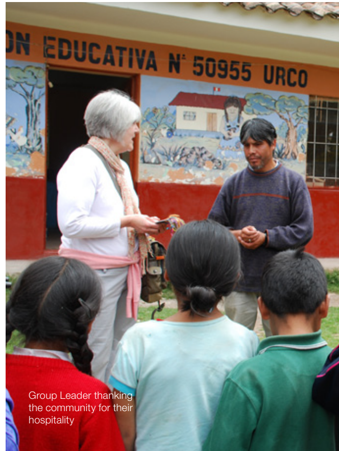
Group Leader thanking the community for their hospitality