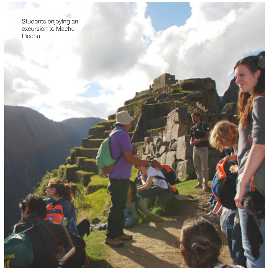
Students enjoying an excursion to Machu Picchu