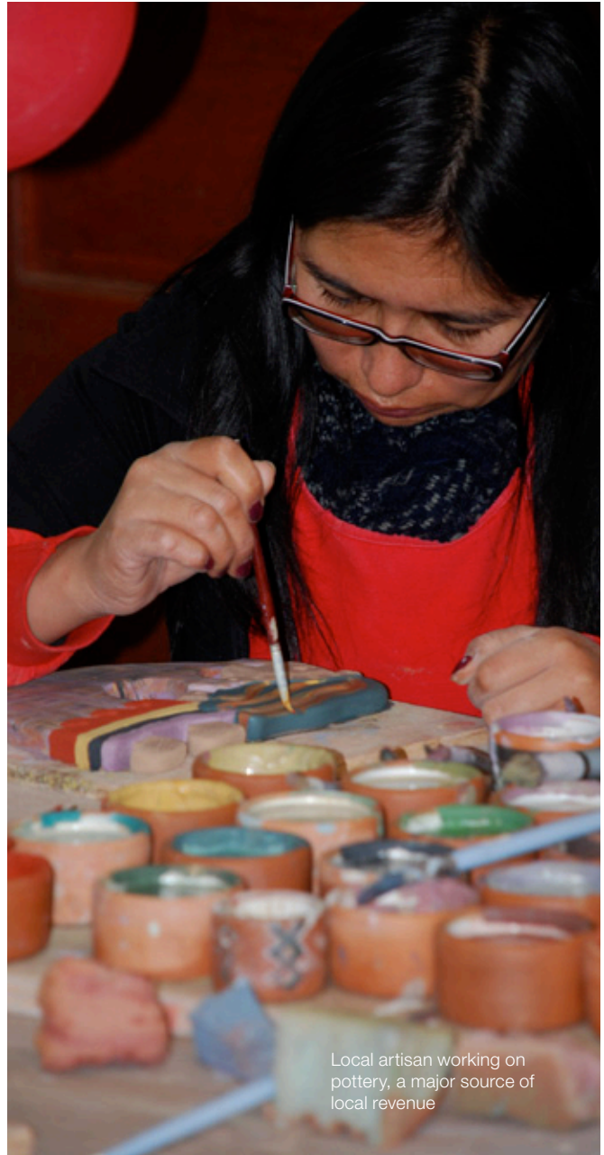
Local artisan working on pottery, a major source of local revenue