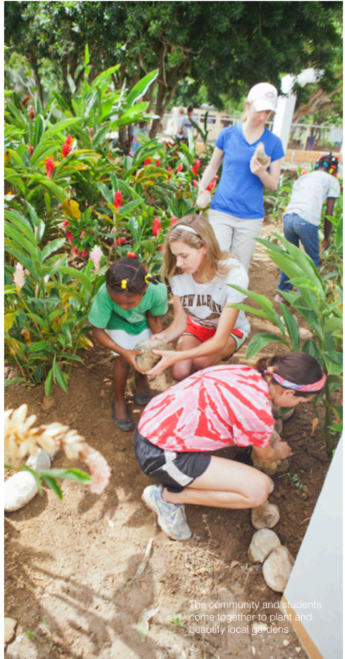
The community and students come together to plant and beautify local gardens