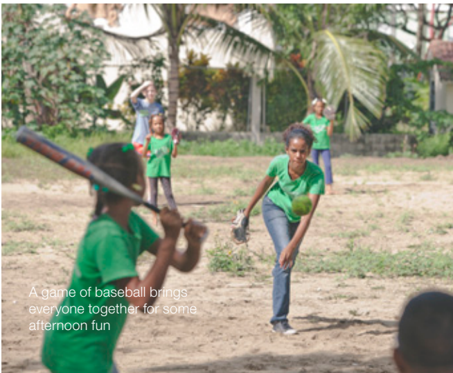
A game of baseball brings everyone together for some afternoon fun