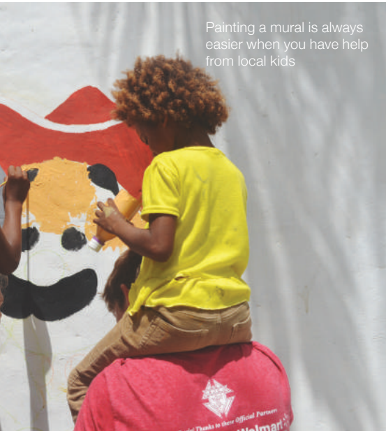
Painting a mural is always easier when you have help from local kids