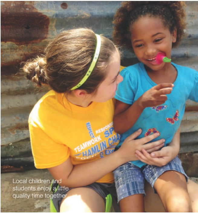
Local children and students enjoy a little quality time together