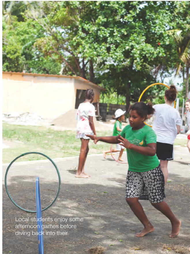
Local students enjoy some afternoon games before diving back into their