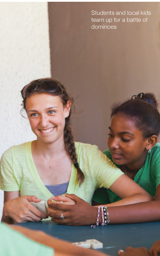
Students and local kids team up for a battle of dominoes