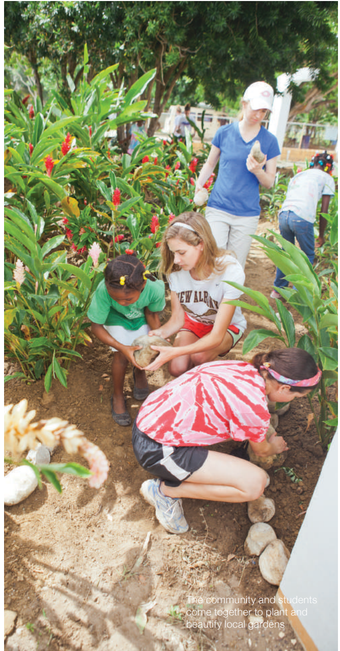
The community and students come together to plant and beautify local gardens