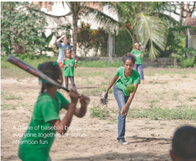
A game of baseball brings everyone together for some afternoon fun