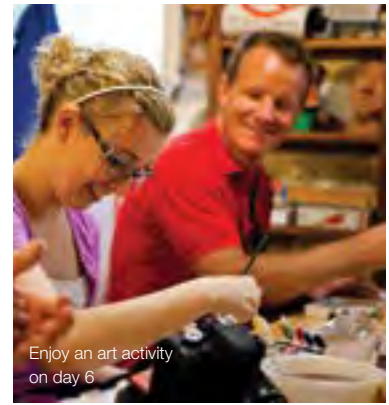
Enjoy an art activity on day 6

We believe in experiential learning at the most important sites. Your Program Director is with you at every step, providing their own perspective and local tips.