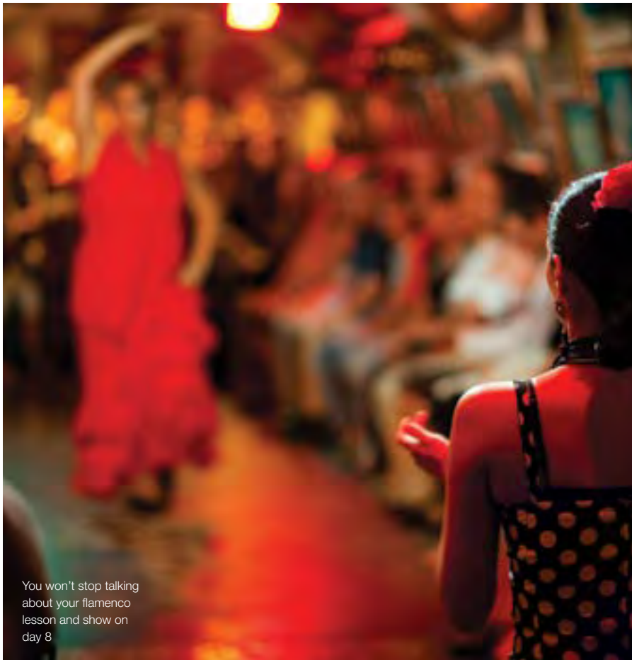
You won't stop talking about your flamenco lesson and show on day 8