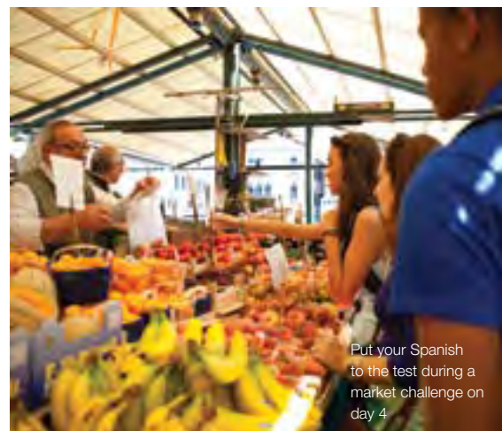
Put your Spanish to the test during a market challenge on day 4.