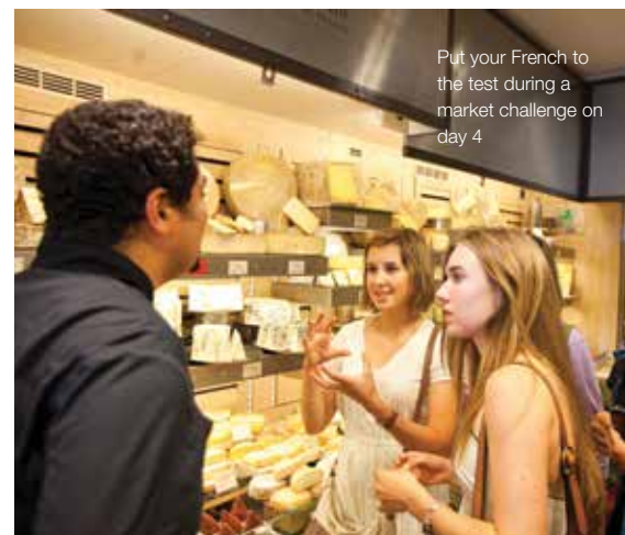
Put your French to the test during a market challenge on day 4