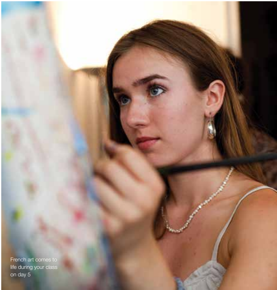
French art comes to life during your class on day 5