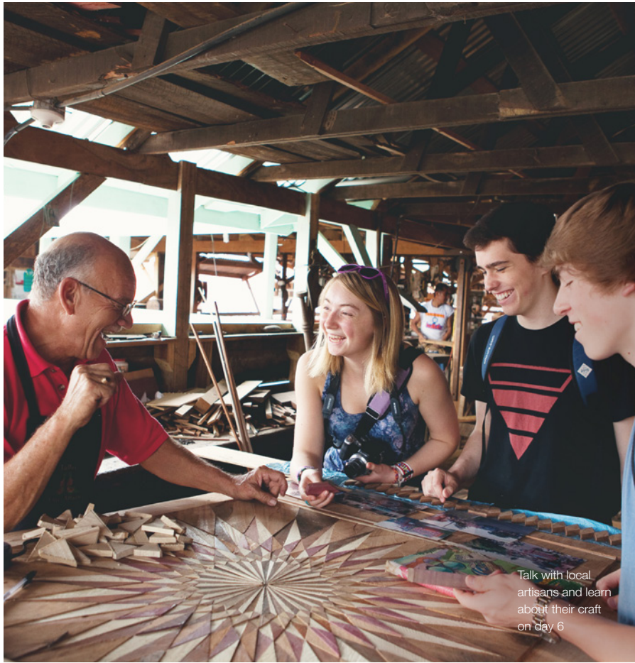
Talk with local artisans and learn about their craft on day 6