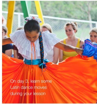
On day 3, learn some Latin dance moves during your lesson

We believe in experiential learning at the most important sites. Your Tour Director is with you at every step, providing their own perspective and local tips.