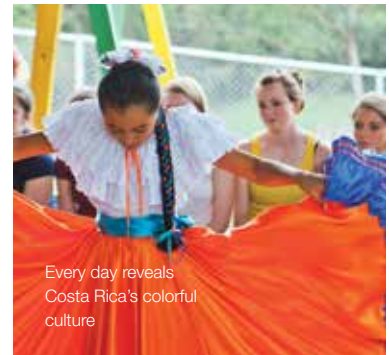
Every day reveals Costa Rica's colorful culture

We believe in experiential learning at the most important sites. Your Tour Director is with you at every step, providing their own perspective and local tips.