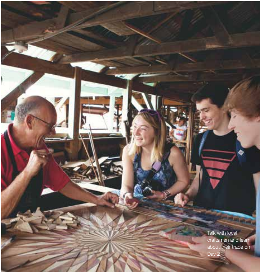
Talk with local craftsmen and learn about their trade on Day 2