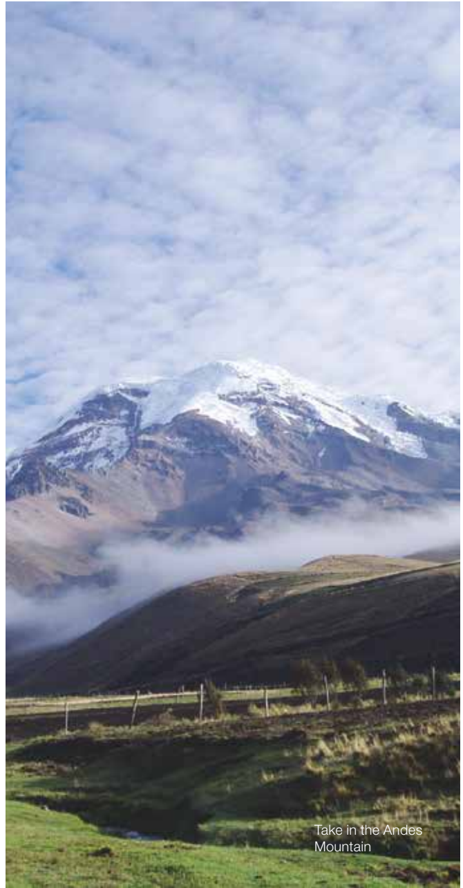
Take in the Andes Mountain