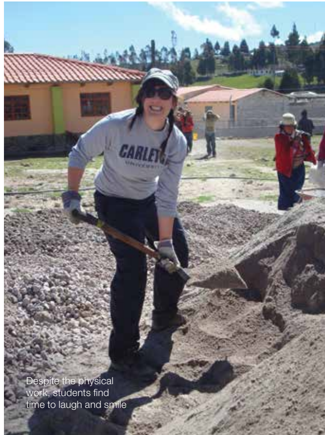
Despite the physical work, students find time to laugh and smile