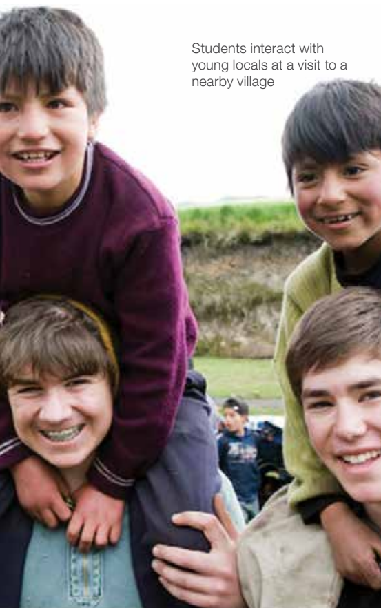
Students interact with young locals at a visit to a nearby village