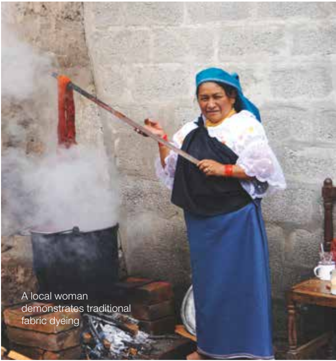
A local woman demonstrates traditional fabric dyeing