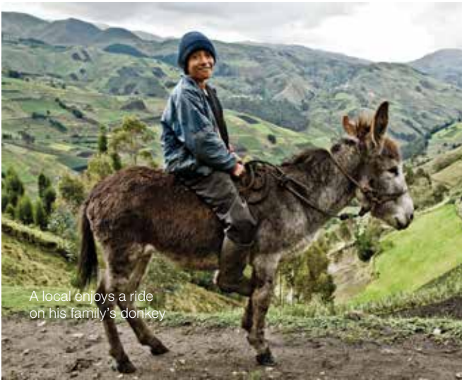
A local enjoys a ride on his family's donkey