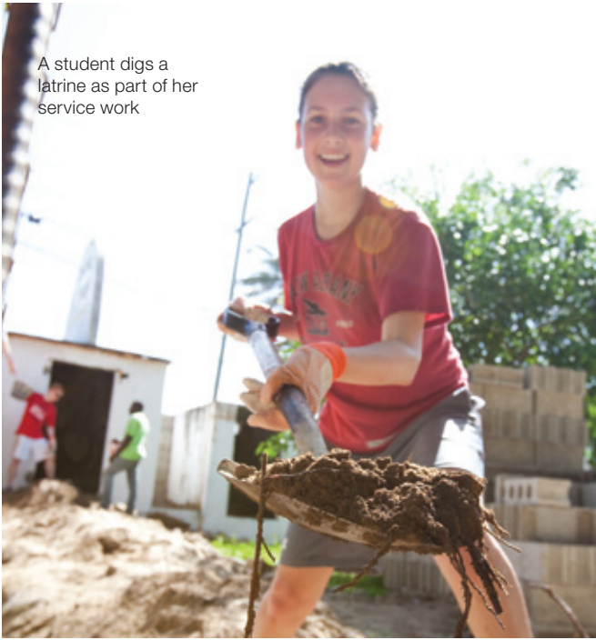
A student digs a latrine as part of her service work