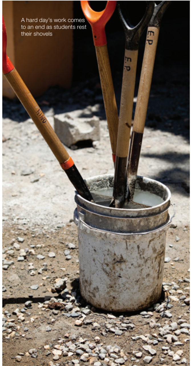
A hard day's work comes to an end as students rest their shovels