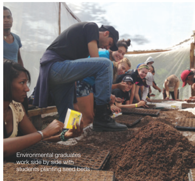
Environmental graduates work side by side with students planting seed beds