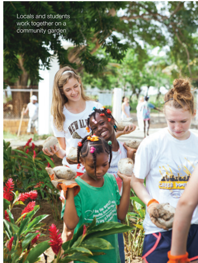
Locals and students work together on a community garden