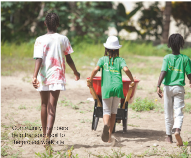
Community members help transport soil to the project work site