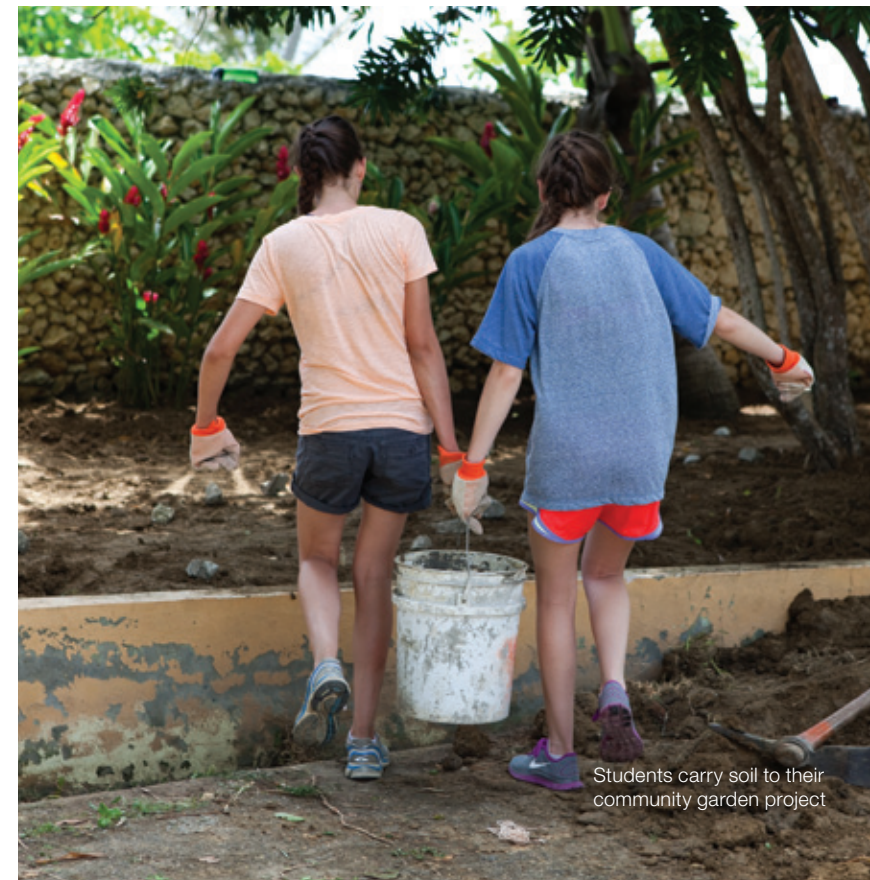
Students carry soil to their community garden project