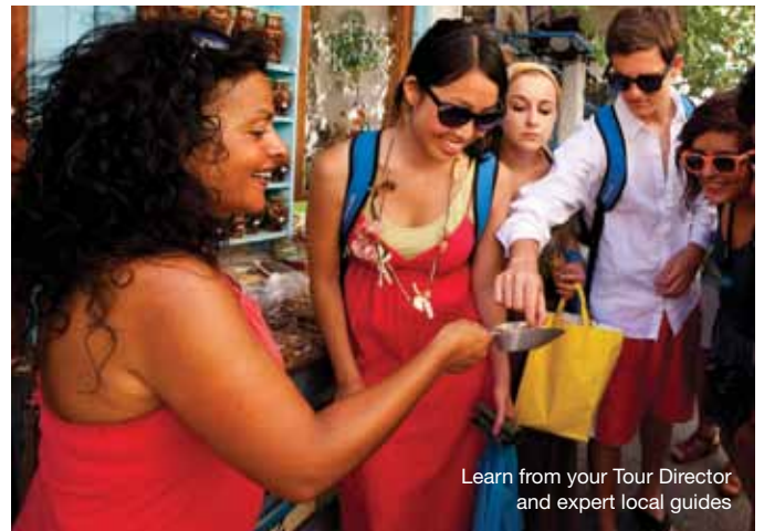
Learn from your Tour Director and expert local guides