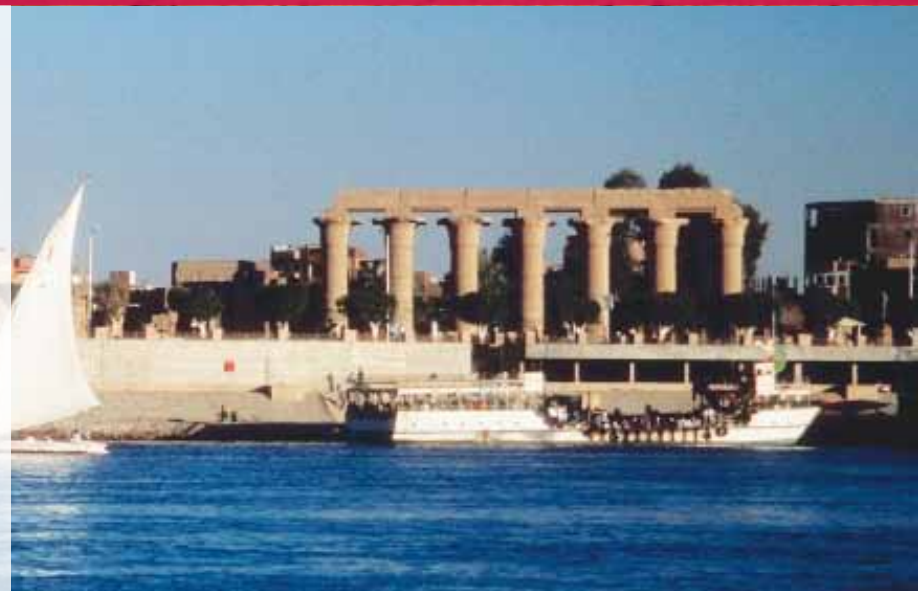
Temple of Luxor Luxor, Egypt

Embark on an unforgettable cruise along Egypt’s legendary Nile River. View Elephantine Island, the oldest inhabited area in Aswan. See the 3,800-meter-long Aswan High Dam, which provides irrigation and electricity for Egypt. In Kom Ombo, see the temple dedicated to the crocodile-headed god Sobek and the falcon-headed god Haroeris. Visit the Temple of Edfu and journey to the Valley of the Kings, the spectacular burial site used by Egyptian rulers, including Tutankhamon. Then, admire the Colossi of Memnon and Queen Hatshepsut’s terraced temple. Continue on to Luxor where the mysterious Avenue of the Sphinxes connects the Temple of Karnak with the Temple of Luxor.