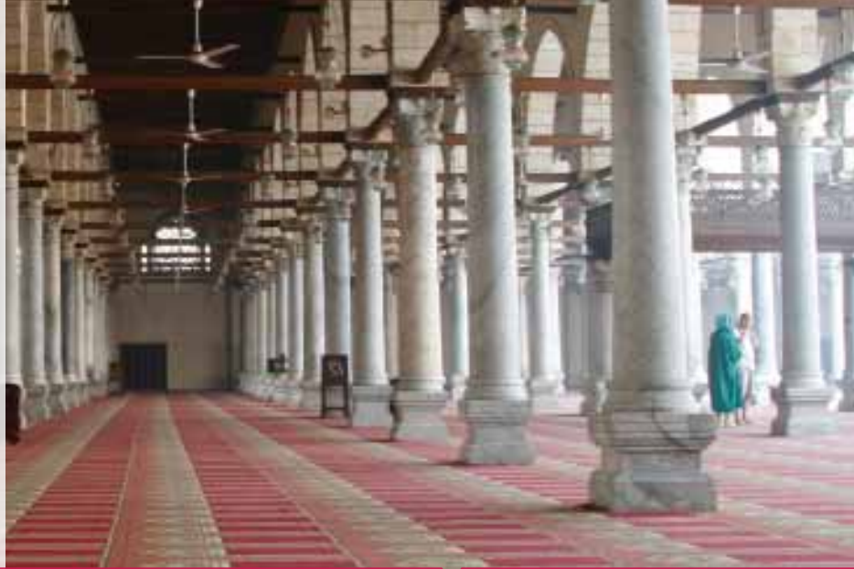
Al-Azhar Mosque Cairo, Egypt

“The City of a Thousand Minarets” is known for its spectacular mosques and monuments. On your sightseeing tour, see the Citadel, one of Cairo’s most popular attractions. The Citadel is one of the world’s greatest monuments to medieval warfare, as well as a highly visible landmark on Cairo’s eastern skyline. On a clear day you can view the Nile and the Pyramids. You will also see the Mohammed Ali Mosque, built in Ottoman baroque style that imitates the great religious mosques of Istanbul. Later on your tour, visit the Egyptian Museum. From papyrus scrolls covered in Egyptian hieroglyphics to thousands of keepsakes, prized by ancient Pharaohs, there is plenty to explore!