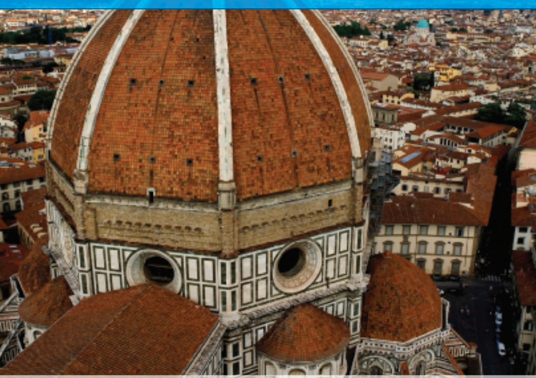
Discover the intricacies of Florence's Duomo, a Renaissance masterpiece, on your grand tour through Europe.