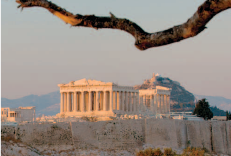
Acropolis Athens, Greece

Discover the ancient city named for Athena, goddess of war and wisdom. Your local guide will lead you up to the Acropolis to view the Parthenon, perhaps the world's greatest architectural feat. See the Temple of Athena Nike, which once housed a gold statue of the goddess, her wings clipped to prevent her from deserting the city. Snap a picture of the Presidential Guard in traditional costume, then, pass the stadium that hosted the first modern Olympics in 1896. A walking tour will take you by Hadrian's Arch and the Temple of Olympian Zeus, built in 515 B.C. to honor the most powerful of all Greek gods.