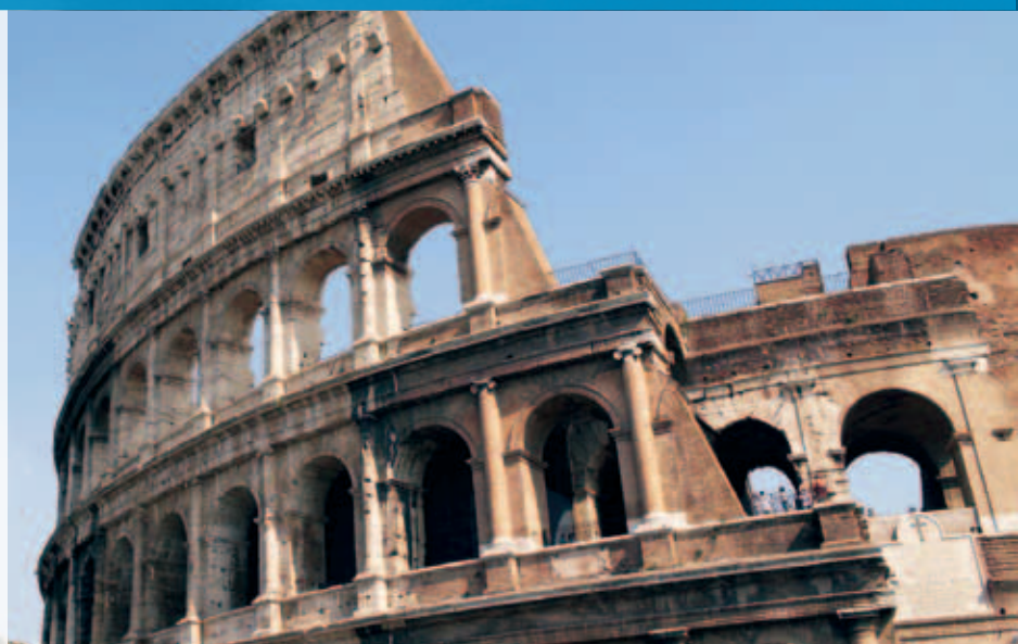
Colosseum Rome, Italy

No place integrates its past into the present quite like Rome, where history comes to life. Explore the world's most famous arena on your sightseeing tour to the Colosseum. Here, you can almost hear the stamping feet of the crowds gathered for gladiatorial combat. Nearby, the Roman Forum marks the former heart of the Roman Empire. Julius Caesar gave many of his great political speeches there. On your visit to Vatican City, marvel at Michelangelo's breathtaking ceiling in the Sistine Chapel and look out for the colorful uniforms of the Swiss Guard, protectors of Vatican City. Before you say "arrivederci," toss a coin into the Trevi Fountain to ensure a return trip to the Eternal City.