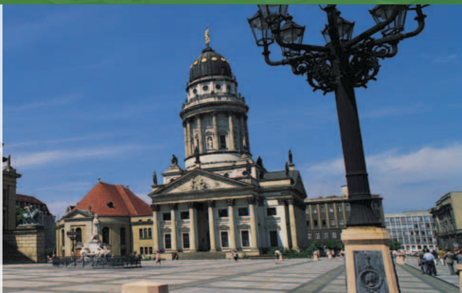
Academy Square Berlin, Germany

Poised at the cutting edge of European culture, this German capital has been transformed since the Berlin Wall fell in 1989. On your tour, visit the Checkpoint Charlie museum, named after the checkpoint station that once guarded the border between East and West Germany. Here you can see escape cars, hot air balloons and even a submarine—all used in risky border crossings. Your walking tour will take you past cafés, restaurants and embassies along Unter den Linden, Berlin's most elegant boulevard. Continue to the imposing Reichstag building, the historical seat of Germany's parliament, and head to the massive glass dome that overlooks the cityscape.