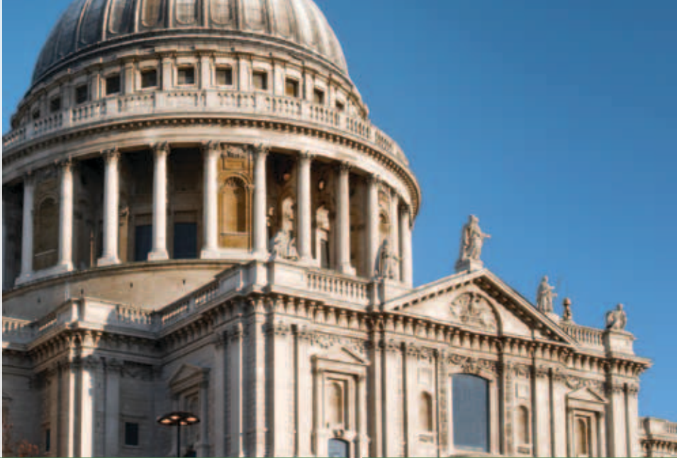
St. Paul's Cathedral London, England

In London, encounter reminders of Great Britain's military history at every turn. See tanks and aircraft utilized by British soldiers at the Imperial War Museum, and gain insight into the everyday challenges presented by modern warfare. Stand in the Cabinet War Rooms, which were used as offices by Winston Churchill and his cabinet during WWII. Large military maps and charts still hang on the walls of these well-preserved underground rooms, where Churchill took refuge when it was too dangerous for him to return home. A sightseeing tour of the city will take you past architectural marvels like the Houses of Parliament and St. Paul's Cathedral, whose Baroque spires escaped major damage during the Blitz.