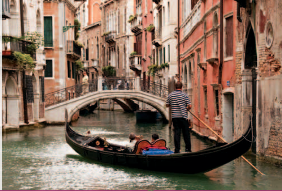
Gondolier Venice, Italy

Crisscrossed with romantic bridges and laced with history, Venice boasts some of the world's finest art and architecture. On your sightseeing tour of the Floating City, see gondolas glide down the Grand Canal before stopping in St. Mark's Square. Look for the golden weathervane, which resembles archangel Gabriel, atop the 323-foot Campanile (Bell Tower). Attend a glass-blowing demonstration and watch expert craftsmen spin molten-hot wares. At the pink-and-white Doge's Palace, see where mighty Venetian dukes once ruled. Stroll over the Bridge of Sighs, which links the palace to a prison. As they crossed the bridge, prisoners supposedly sighed with perfect sadness as they regarded their beautiful city for the last time.