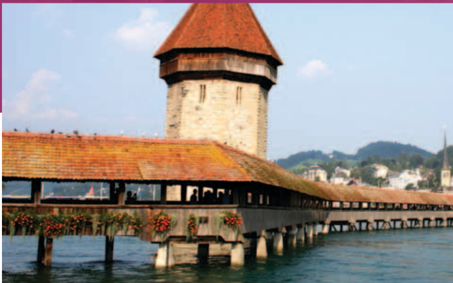
Chapel Bridge Lucerne, Switzerland