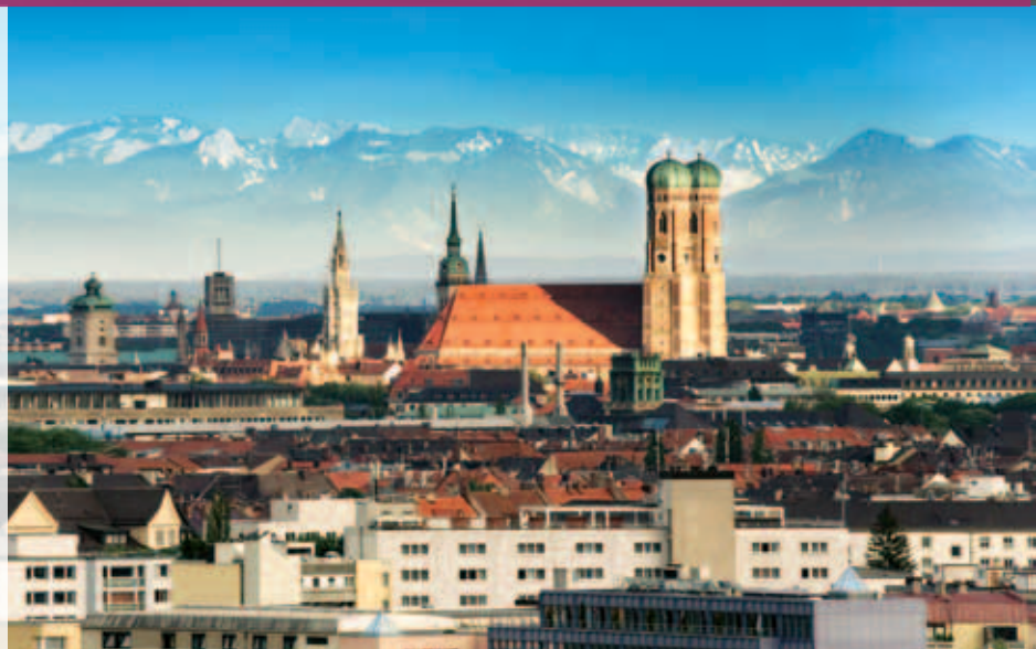
Frauenkirche Cathedral Munich, Germany

Experience Munich, from the medieval to the modern. Your sightseeing tour will take you past the Olympic Stadium, BMW headquarters, the fashionable Schwabing district and the Residenz, former home of the Wittelsbach dukes of Bavaria. Visit Dachau, a WWII Nazi concentration camp built in 1933 and liberated by the Allies in 1945. It now serves as a memorial museum. A walking tour will take you through the heart of Munich, where medieval trade routes once intersected. In Marienplatz, see the neo-Gothic New City Hall with its famous Glockenspiel. Then continue past the famous Hofbräuhaus, once the royal brewery of the Kingdom of Bavaria.