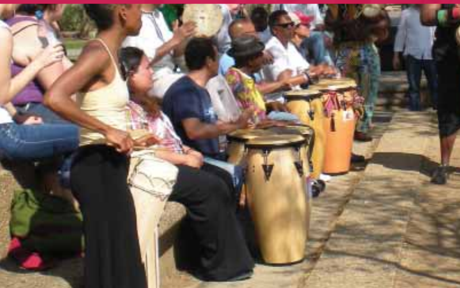
Drum circle Accra, Ghana