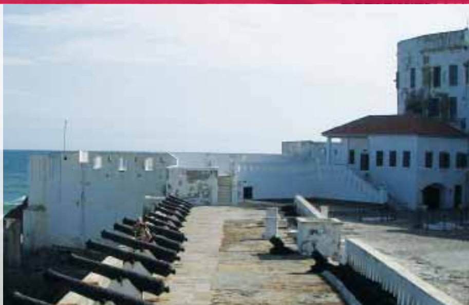
Cape Coast Castle Cape Coast, Ghana

Travel on an excursion to the Cape Coast and tour Cape Coast Castle. Established as a fortification site in 1653, the castle held hundreds of slaves as they awaited transfer by boat to the Western Hemisphere. Learn about the history of the slave trade in a documentary film at the castle museum. Walk the grounds of Elmina Castle. Built by the Portuguese in 1482, Elmina Castle was the first trading post on the Gulf of Guinea, and later became an important stopping point for the Atlantic Slave Trade. Today, it serves as a popular and significant historical landmark. Both castles are recognized as UNESCO World Heritage Sites.