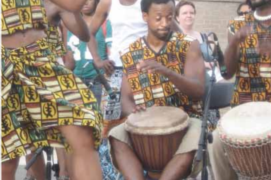
African musical performance Accra, Ghana

Situated on a beautiful campus at the ocean's edge, the Kokrobitey Institute is committed to promoting Ghanaian culture. Since it was founded in 1992, Kokrobitey Institute has offered programs to professional institutions, government agencies and school groups, among others. Activities at the institute center around local and sustainable development programs, focusing on environmental studies, art and design. Following an introductory overview, attend a lecture about the Ga people, the traditional rulers of the Accra and coastal regions. Finally, experience the rhythms of the local culture at a special African drum and dance performance.