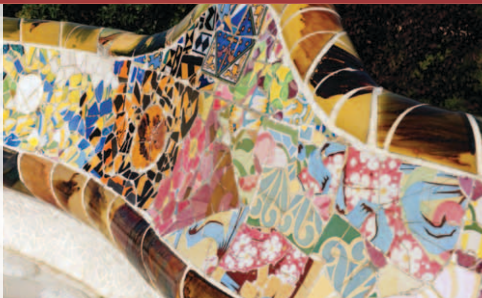
Parque Guell Barcelona, Spain

Travel back in time to Spain's Golden Age! Your sightseeing tour takes you to the Puerta del Sol, the heart of this Spanish capital. At Plaza Mayor, you'll learn about this grand square's history of bullfights, royal weddings and public executions. At the Prado art museum, behold paintings like Velázquez's Las Meninas and Goya's paired canvases. Continue to the green gardens and monuments of the Plaza de Oriente before visiting the extravagant Palacio Real for a taste of royal Madrid. Wander the fabulous interior of this palace, which contains more than 2,000 rooms decked in extravagant frescoes, delicate porcelain wares and finely woven rugs.