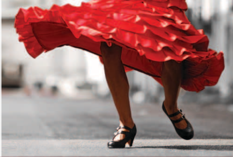
Flamenco show Barcelona, Spain

Experience the many facets of Spanish life as you participate in hands-on cultural activities on your journey through Spain. Take in the sights and scents of a teteria, a traditional Moroccan tea house, where the décor and aromatic teas delight the senses. Then get an inside look at a local business during your tour of the Carbonell Olive Oil Factory, which has produced olive oil in Córdoba since the 19th century. Learn to move like the Spanish do during salsa lessons, enjoy a flamenco show and meet local students during an exchange. Before saying adios, you'll also try your hand at Spanish art during a fusing workshop.