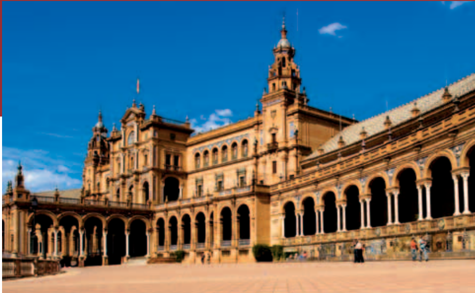
Plaza de España Seville, Spain