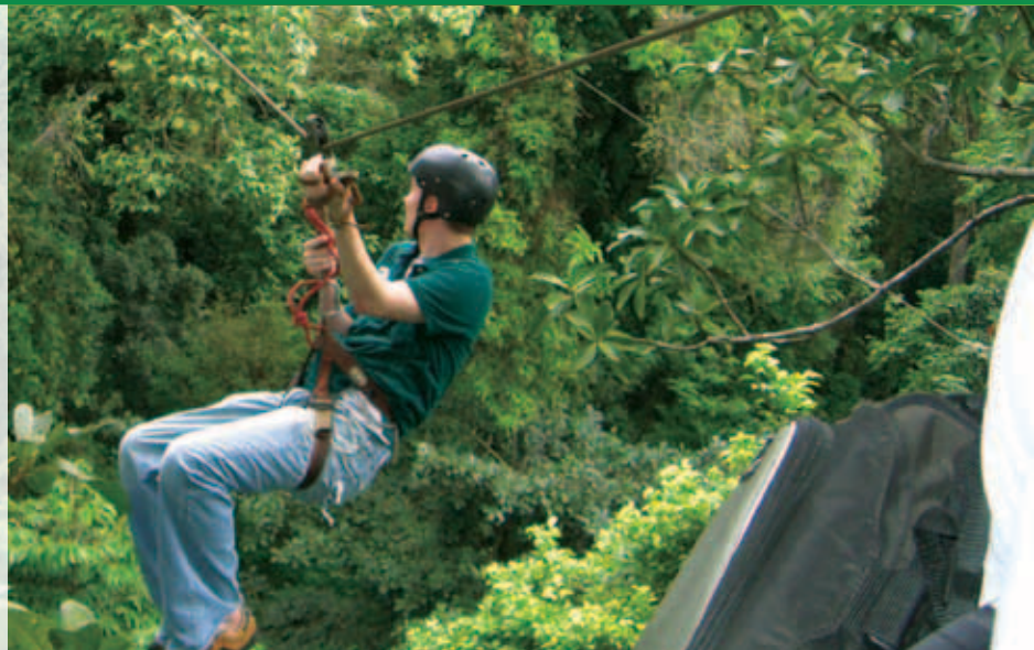
Canopy tour Monteverde, Costa Rica

Situated near the Continental Divide, the Monteverde (Green Mountain) region contains a spectacular range of flora and fauna in six distinct ecological zones. You'll tour the greenery of the Santa Elena Cloud Forest, where you can look for the rare orchids and elusive quetzal birds that thrive in the perpetual soft mist. At this altitude, you'll literally walk through clouds! Leave a positive mark on the earth when your group plants a tree together. Then, visit a local school, where students will welcome your group with traditional dances.