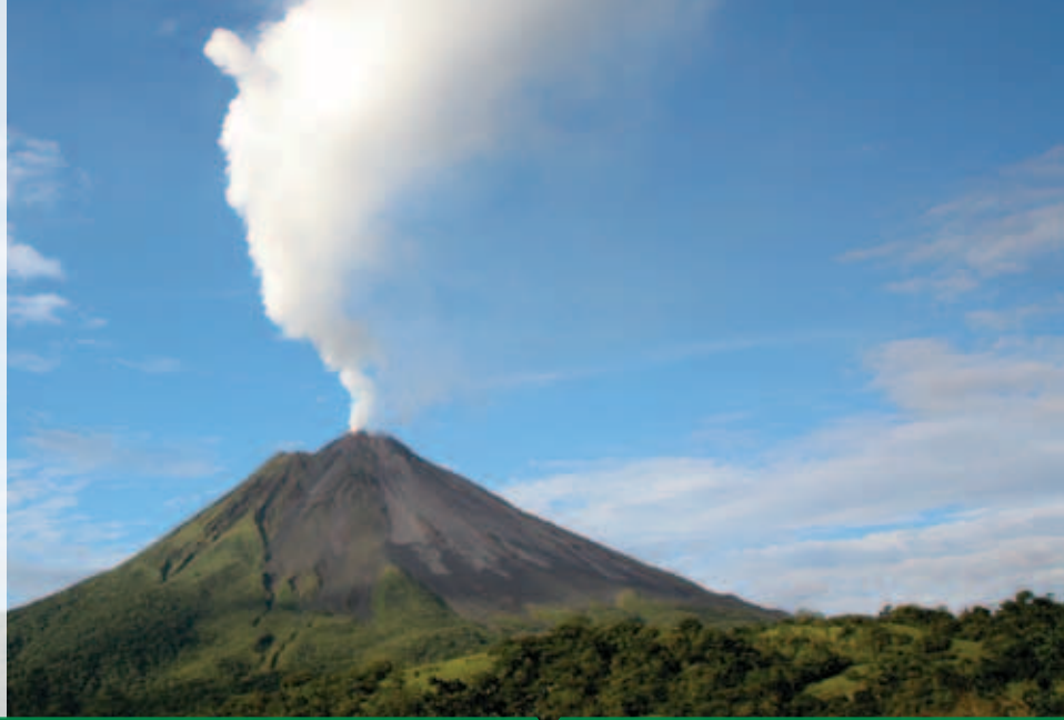
Arenal Volcano Arenal region, Costa Rica

Get ready for an adventure to remember in Costa Rica's Arenal region! Behold the perfect conical shape that emerges from the green hills of Alajuela: this is the fascinating Arenal Volcano. Overlooking the San Carlos plain and the Pacific lowlands, this mile-high volcano has been active for the past 7,000 years. You'll see the volcano from a different angle on your kayaking excursion. Not only does the volcano serve as a watershed for the lake, but it also provides thermal energy for the nearby hot springs. Relax in these naturally heated pools; then, walk to the bottom of the spectacular La Fortuna waterfall.