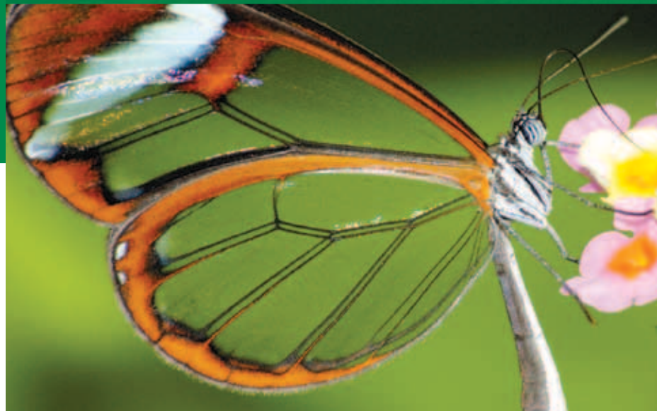
Exotic butterfly - INBioparque San José, Costa Rica