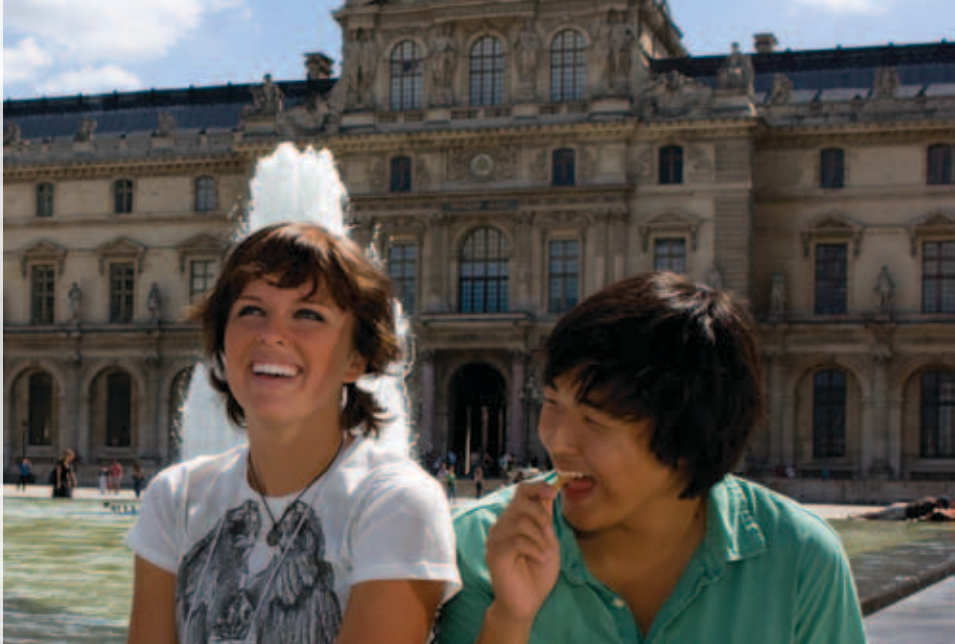
Louvre Paris, France

Bonjour, Paris! During your sightseeing in the City of Light, get a taste of Parisian style as you ride down the Champs-Élysées, an elegant boulevard packed with high-fashion boutiques. Pass the Place de la Concorde and the Arc de Triomphe and strike a pose in front of the Eiffel Tower. At the École Militaire, see where a promising young Napoleon launched his rise to power. I.M. Pei's iconic glass pyramid marks the entrance to the renowned Louvre, home to treasures like Leonardo da Vinci's Mona Lisa . Then, travel to the Notre Dame Cathedral and admire its sculptured façade, stained-glass rose windows and seemingly weightless vaulted ceilings.