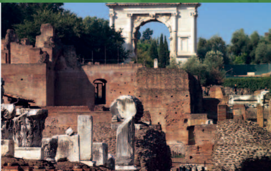
Roman Forum Rome, Italy

No place integrates its past into the present quite like Rome, where history comes to life. Explore the world's most famous arena on your sightseeing tour to the Colosseum. Here, you can almost hear the stamping feet of the crowds gathered for gladiatorial combat. Nearby, the Roman Forum marks the former heart of the Roman Empire. Julius Caesar gave many of his great political speeches there. On your visit to Vatican City, marvel at Michelangelo's breathtaking ceiling in the Sistine Chapel and look out for the colorful uniforms of the Swiss Guard, protectors of Vatican City. Before you say "arrivederci," toss a coin into the Trevi Fountain to ensure a return trip to the Eternal City.