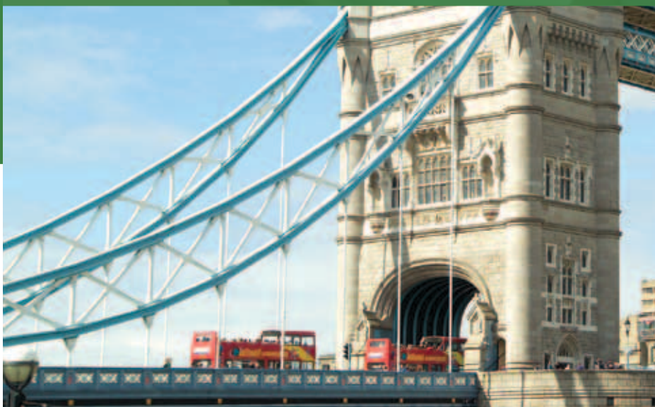
Tower Bridge London, England