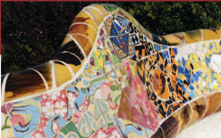
Parque Guell Barcelona, Spain