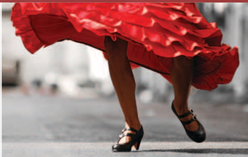
Flamenco dancer Madrid, Spain

Feel the beat this evening as you experience flamenco, the fiery dance full of Spanish soul. Born of Indian, Moorish, Arabian and gypsy influences, flamenco is characterized by intricate footwork and clapping displays. During your lesson, your instructor will demonstrate basic techniques and describe flamenco's history and origins. Then, let the classical guitar be your guide and try it out yourself! Later, watch bona fide flamenco artists in action during a special performance. The impressive adornments worn by many dancers match the passionate rhythm of the dance itself—their colorful costumes and dramatic ruffles are sure to dazzle!