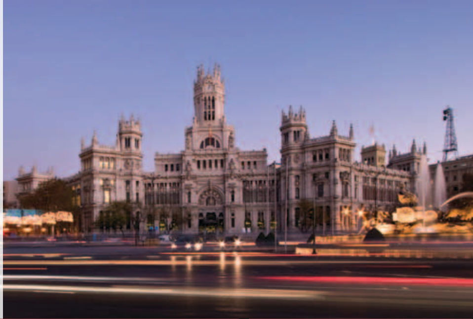
Plaza de la Cibeles Madrid, Spain

Travel back in time to Spain's Golden Age! Your sightseeing tour takes you to the Puerta del Sol, the heart of this Spanish capital. At Plaza Mayor, you'll learn about this grand square's history of bullfights, royal weddings and public executions. At the Prado art museum, behold paintings like Velázquez's Las Meninas and Goya's paired canvases. Continue to the green gardens and monuments of the Plaza de Oriente before visiting the extravagant Palacio Real for a taste of royal Madrid. Wander the fabulous interior of this palace, which contains more than 2,000 rooms decked in extravagant frescoes, delicate porcelain wares and finely woven rugs.