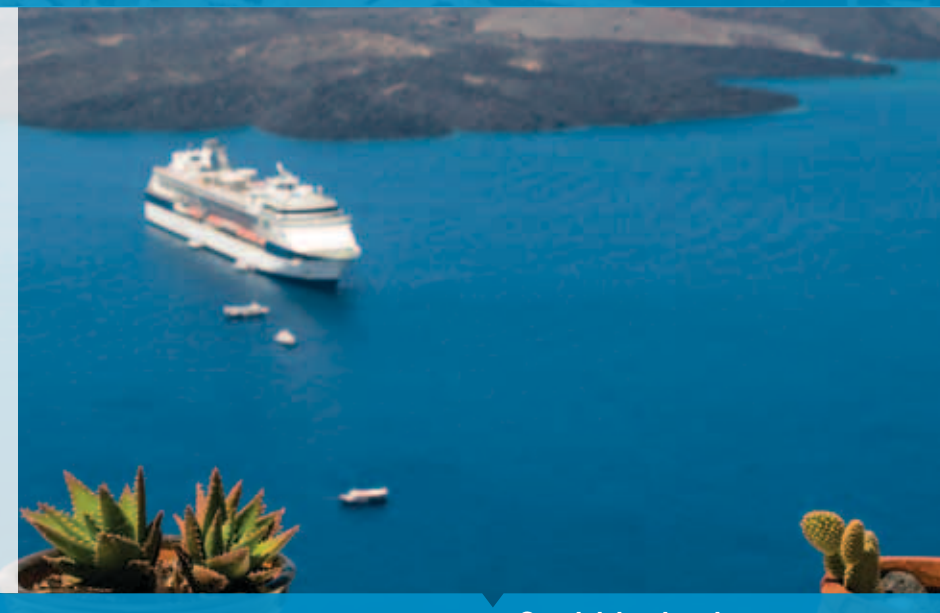
Greek island cruise Santorini, Greece

Your 4-day cruise will take you to the islands and coastal towns of Greece and Turkey. Enjoy on-board activities as you sail to Mykonos, Kusadasi, Patmos, Rhodes, Crete and Santorini. Beautiful crystalline waters and white sand beaches helped make these destinations prized—and disputed—territories. Turkish, Roman and Greek influences helped shape the unique blend of cultures you'll encounter. At points of disembarkation, choose to enhance your experience with an optional shore excursion package to Ancient Ephesus, St. John's Grotto, as well as Rhodes and Lindos. Additional excursions will be offered by the cruise line.