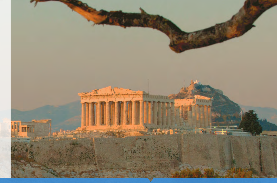
Acropolis Athens, Greece

Discover the ancient city named for Athena, goddess of war and wisdom. Your local guide will lead you up to the Acropolis to view the Parthenon, perhaps the world's greatest architectural feat. See the Temple of Athena Nike, which once housed a gold statue of the goddess, her wings clipped to prevent her from deserting the city. Snap a picture of the Presidential Guard in traditional costume, then pass the stadium that hosted the first modern Olympics in 1896. A walking tour will take you by Hadrian's Arch and the Temple of Olympian Zeus, built in 515 B.C. to honor the most powerful of all Greek gods.