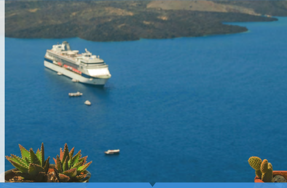
Greek island cruise Santorini, Greece

Your 4-day cruise will take you to the islands and coastal towns of Greece and Turkey. Enjoy on-board activities as you sail to Mykonos, Kusadasi, Patmos, Rhodes, Crete and Santorini. Beautiful crystalline waters and white sand beaches helped make these destinations prized—and disputed—territories. Turkish, Roman and Greek influences helped shape the unique blend of cultures you'll encounter. At points of disembarkation, choose to enhance your experience with an optional shore excursion package to Ancient Ephesus, St. John's Grotto, as well as Rhodes and Lindos. Additional excursions will be offered by the cruise line.