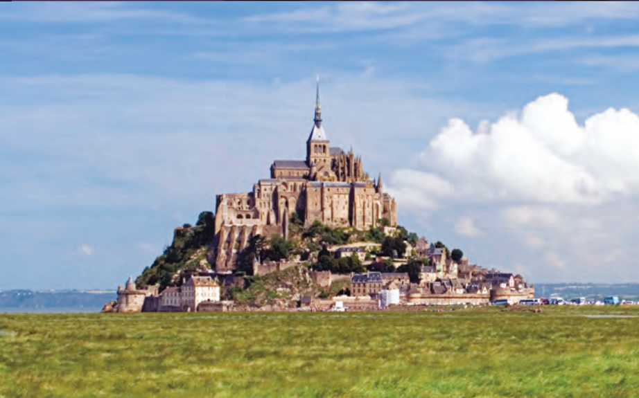
Mont St. Michel Normandy, France