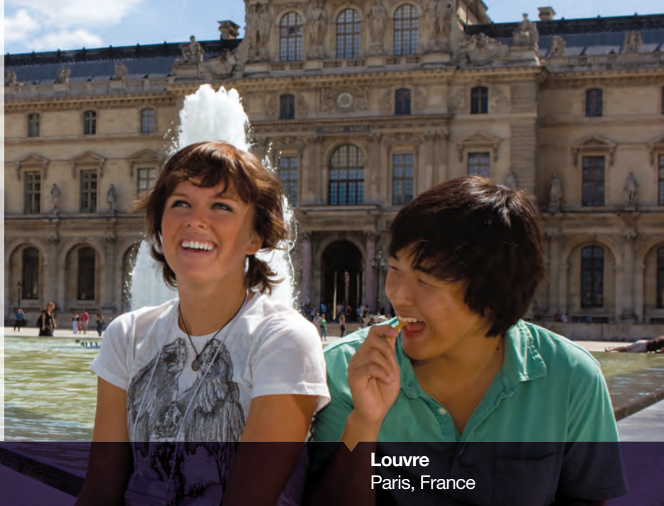
Louvre Paris, France

Bonjour, Paris! During your sightseeing in the City of Light, get a taste of Parisian style as you ride down the Champs-Élysées, an elegant boulevard packed with high-fashion boutiques. Pass the Place de la Concorde and the Arc de Triomphe and strike a pose in front of the Eiffel Tower. At the École Militaire, see where a promising young Napoleon launched his rise to power. I.M. Pei's iconic glass pyramid marks the entrance to the renowned Louvre, home to treasures like Leonardo da Vinci's Mona Lisa. Then, travel to the Notre Dame Cathedral and admire its sculptured façade, stained-glass rose windows and seemingly weightless vaulted ceilings.