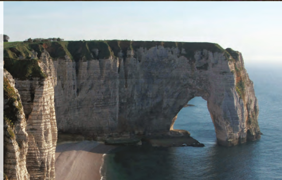
Natural arch formation Normandy, France

On June 6, 1944 (the date now known as D-Day), Allied troops landed on the beaches of Normandy, launching the campaign that eventually liberated mainland Europe from the Nazis. Witness remnants of the floating roadways and piers built to create an instant port at Arromanches. Visit the Pointe du Hoc Ranger Monument commemorating the special forces who scaled a 100-foot cliff to seize German artillery. See the Normandy American Cemetery and Memorial established—out of necessity—just two days after the invasion. Pay tribute to WWII troops at the Caen Memorial, one of Europe's top history museums. Exhibits and films document the events that led up to the war and the Normandy invasion.