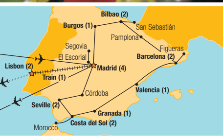
Number of overnight stays in parentheses. This tour may also be reversed.