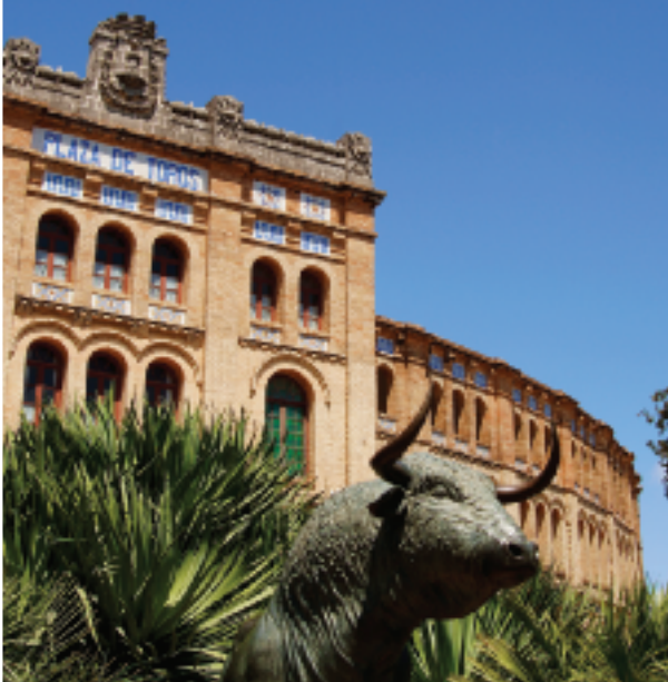
Some compare the art of flamenco dance to the artistry of toreros, Spanish bullfighters, who engage in a sort of dance with the bull.