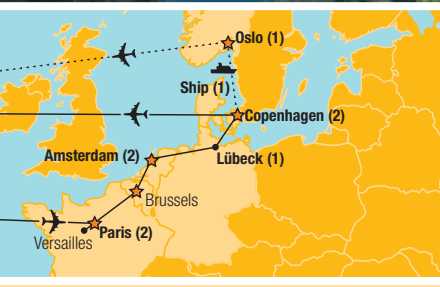
Number of overnight stays in parentheses.