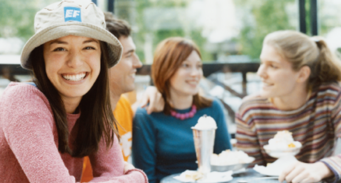
The Champs-Elysées in Paris is perfect for shopping, people-watching and indulging in ice cream!