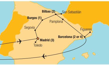
Number of overnight stays in parentheses. This tour may also be reversed.