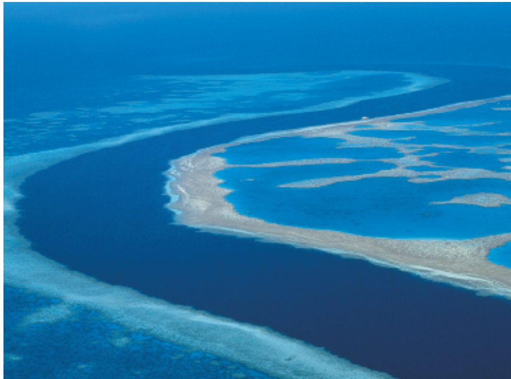
The Great Barrier Reef extends for more than 1,200 miles along the Australian coast.

Optional Kuranda and the Rainforest • Your excursion begins with a scenic train ride up to the lush Atherton Tablelands, a tropical rainforest home to crystal clear crater lakes, pristine waterfalls and dramatic mountain lookouts. The railway climbs to the quaint rainforest village of Kuranda. After time for browsing in the markets of Kuranda, descend via Skyrail—the first eco-tourism rail system in the world—back down the escarpment. From the Skyrail, you'll enjoy breathtaking aerial views of the rainforest canopy below, as rangers provide you with informative details about the rainforest. Upon reaching the foot of the valley, visit the Tjapukai Aboriginal Park and learn about traditional Aboriginal culture and customs through the interpretive exhibits there.