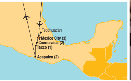
Number of overnight stays in parentheses. This tour may also be reversed.