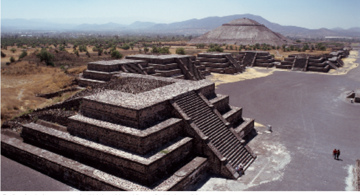
Teotihuacán-the Aztec name meaning "birthplace of the gods"-once flourished as a religious center.

Frida Kahlo Museum and Coyoacan Ballet Folklórico