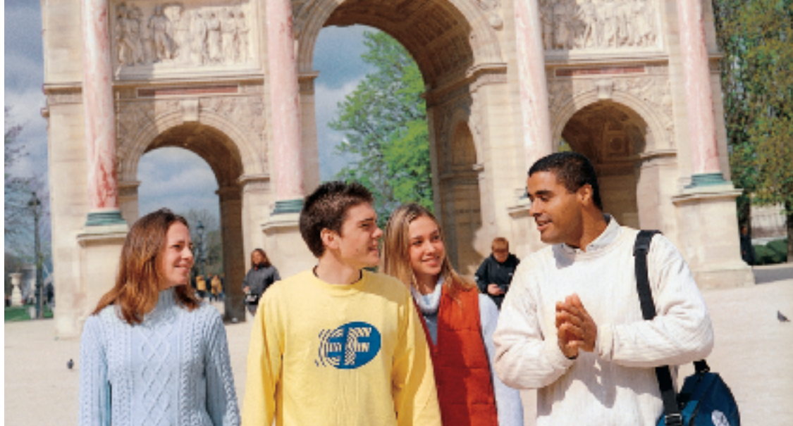
Walk amid the exquisite sculptures and lush gardens of the Tuileries.