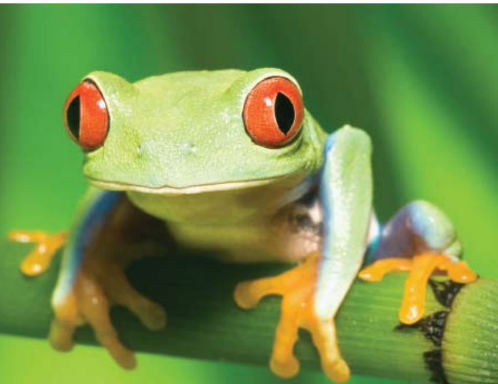
The red-eyed tree frog uses its bright green color for camouflage and its red eyes to startle predators.

For complete financial and registration details, please refer to the Booking Conditions.