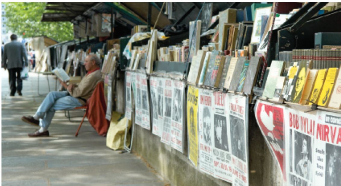
Peruse old books, postcards and other wares from les bouquinistes that line the Seine River in Paris.