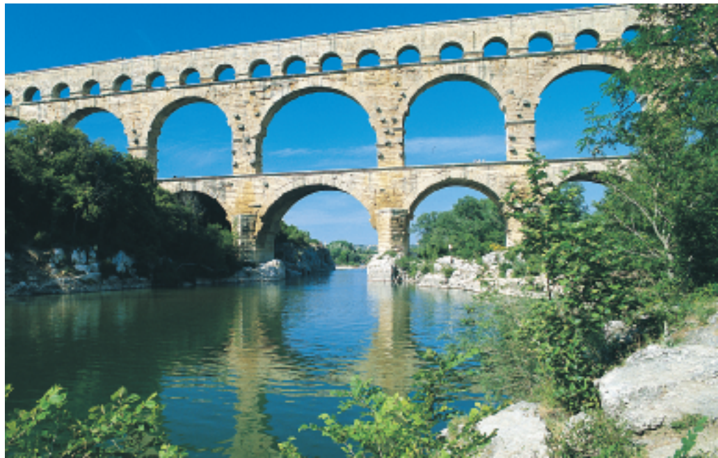
The Pont du Gard is a Roman masterpiece that allows the Nîmes aqueduct to cross the Gard River.

Excursion to Monaco • Follow the coastline of the Riviera to Monaco, a tiny principality that packs wealth, royalty and the world's most famous casino into just 0.8 square miles. The Grimaldi family has ruled Monaco since 1297, making it the longest-reigning family dynasty in Europe. See the Prince's Palace and pass by the Cathédrale de Monaco, site of Prince Rainier's wedding to Grace Kelly in 1956. The cathedral is also the final resting place of both Prince Rainier, who died in 2005, and Princess Grace, who was killed in a car accident in the hills of Monaco in 1982. Catch a glimpse of the stately Monte-Carlo Casino as you stroll the streets with your tour director. The casino was built in 1878 by Charles Garnier, who also designed the Paris Opéra.