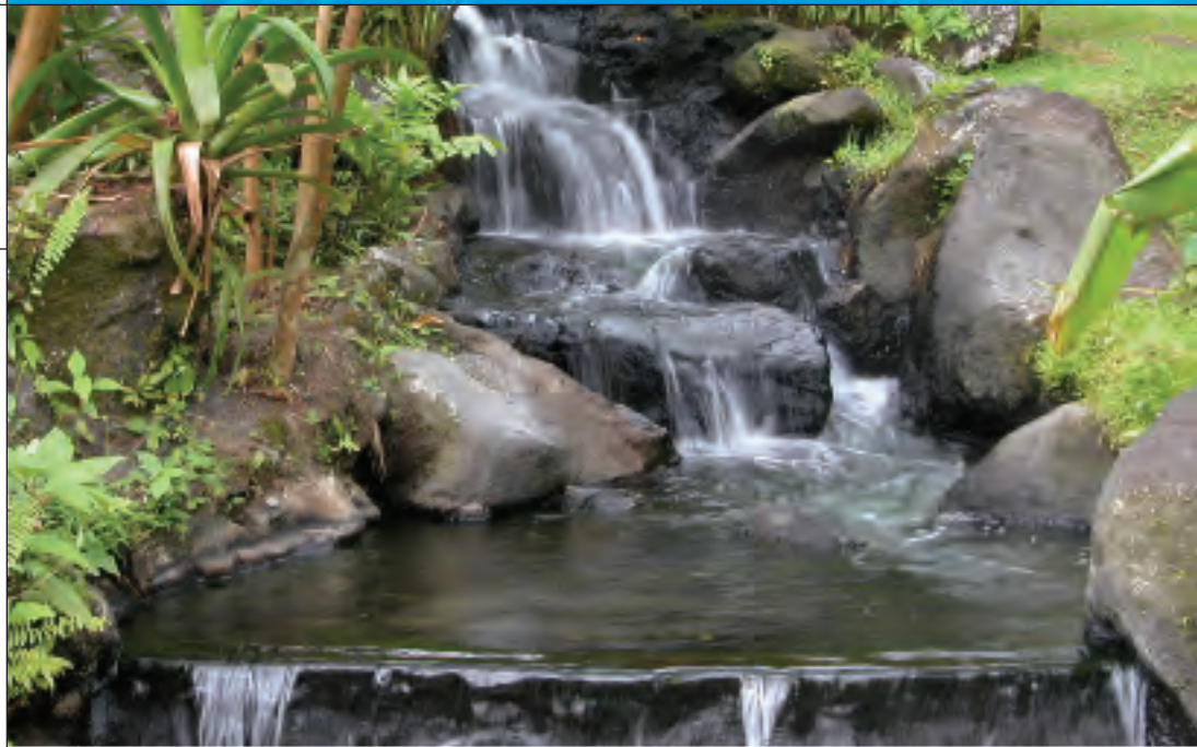
Enjoy the natural scenery in Costa Rica.

Delve into the ecological diversity of Costa Rica as you discover rainforests, volcanoes and hot springs. Visit a banana plantation, take an excursion to Tortuguero National Park—famous as a rare turtle breeding ground—kayak along Lake Arenal and admire the magnificent La Fortuna Waterfall.