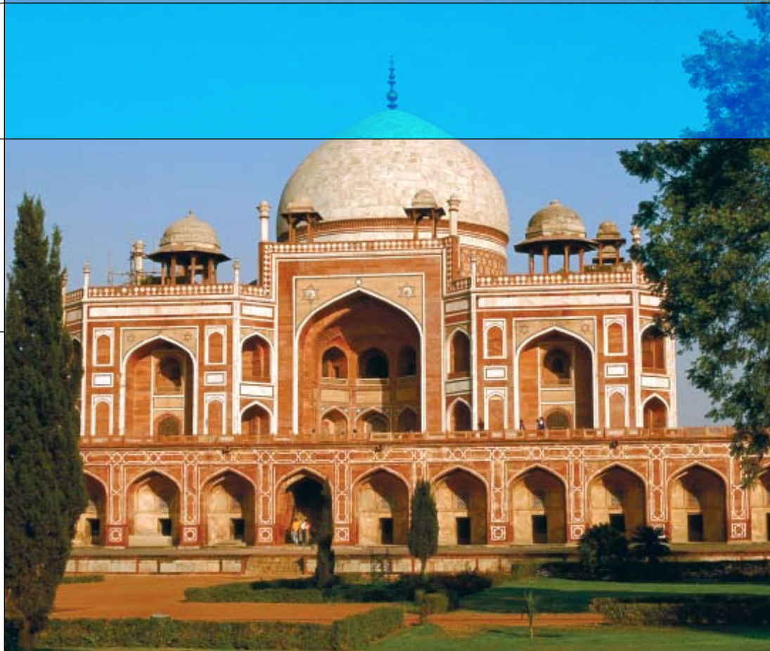
Humayun's Tomb in Delhi was built in 1570 and was the first "garden tomb" on the Indian continent.

* PLEASE NOTE: Typical business visits may include car manufacturing plants or technology, pharmaceutical, or import/export companies. Itineraries are subject to change. Business visits and lectures will be scheduled subject to availability and confirmed prior to departure date.