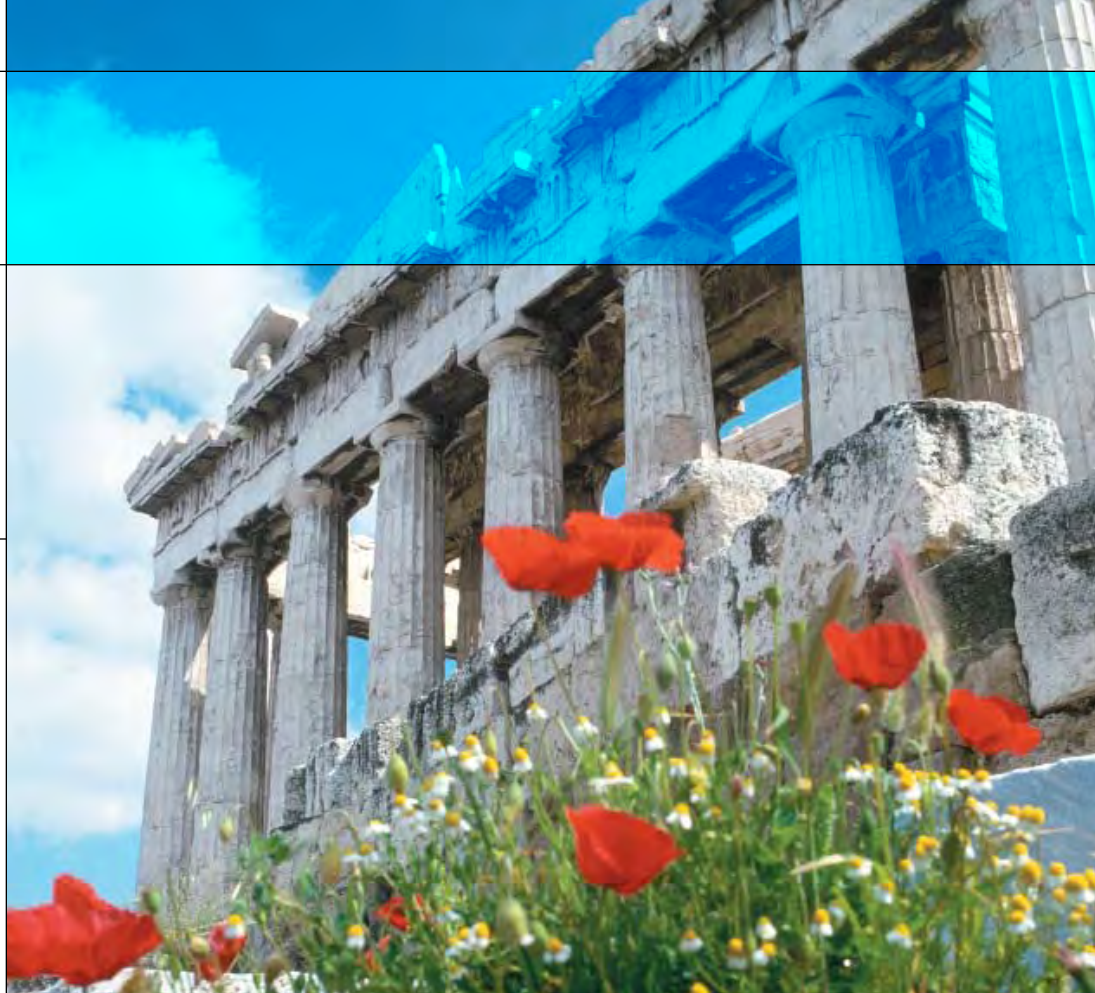
The Acropolis was built as a sanctuary for the goddess Athena, and the grandest temple on the Acropolis is the Parthenon.

Italy and Greece provide the perfect backdrop for bringing history and art to life. Gaze up at Michelangelo's Sistine Chapel masterpiece and see what remains of Pompeii's luxurious past. Trace Odysseus' footsteps in Greece, feeling the spirit of the Greek gods in Athens and Delphi. Pay homage to the artists, architects and philosophers who have gone before—and marvel at the bright future of these two countries.