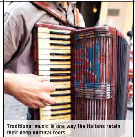
Traditional music is one way the Italians retain their deep cultural roots.

Walking tour of Rome • Continue on to the legendary Trevi Fountain and make sure to toss in a coin to ensure your return to Rome. Then view the Pantheon, one of the best-preserved ancient buildings in the city, commissioned by the Emperor Hadrian around A.D. 120. This temple to “all the gods” features the second-widest dome in Rome. It was built using the exact proportions of an egg! Finish off in the Piazza Navona, the popular square where you will see Bernini’s impressive Fountain of the Four Rivers.